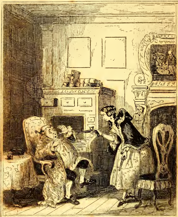
The Duchess of Devonshire forcing her refractory Bankier to cash up.